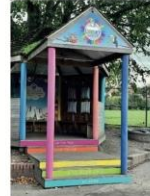
Hollywood Monster for the awesome prints transforming our Library Lodge!