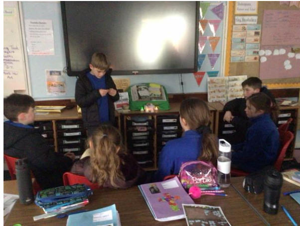
1 - Our Caritas ambassadors reading prayers from the prayer stop in school. During the Year of Prayer we are all encouraged to spend time alone with God.